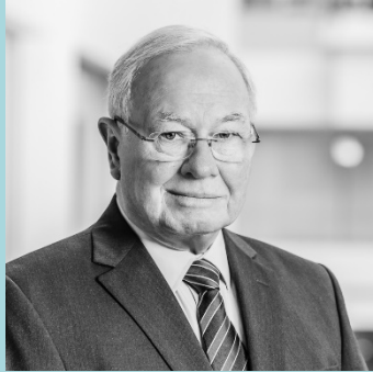
The Hon. Bruce Lander QC Independent Commissioner Against Corruption